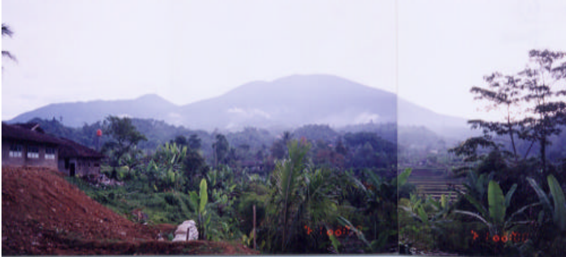
Figure F.2. Mount Gede (right) and Pangrango (left), west Java, Indonesia (figure F.1 )