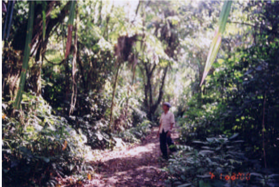
Figure F.8. Variation of Montane forest, fern, moss and bush (950m asl)( figure F.1 )