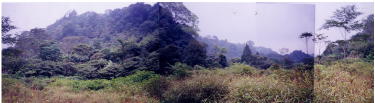
Figure F.5. Hill of Mount Gede with variation of grass, fern, and rasamala. Pondok Halimun district in Gede Pangrango National Park. Land surface around this area is wavy (figure F.1 )