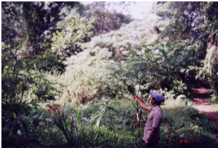
Figure F.9. Small tree trunk of rasamala that nominates hill of Mount Gede Pangrango (1030m asl) in Cicurug National Park (figure F.1 ).