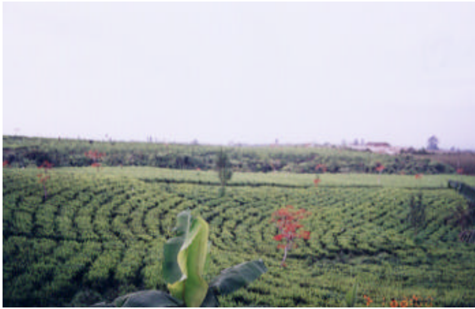
Figure F.4. Tea plantation around Mount Gede at Pasiripis district, Pondok Halimun, Cipelang Selabintana Sukabumi (figure F.1 ).