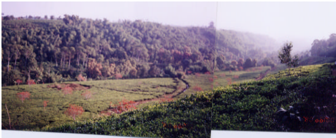
Figure F.7. Rasamala forest and tea plantation near Cipelang river (850m asl)( figure F.1 )