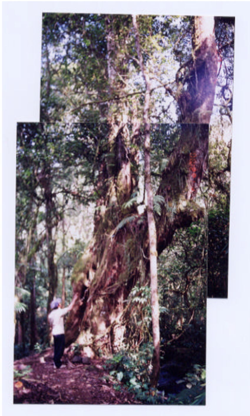
Figure F.10. Rasamala ( Altingia excelsa ) in Mount Gede Pangrango with diameter 50 – 200cm and height about 7 – 20m. It grows at attitude 700 – 1750m asl (figure F.1 ).