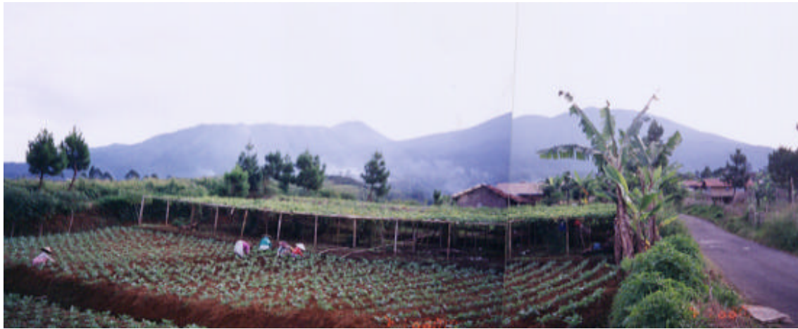
Figure F.6. Tea and tobacco plantation at Wanasari district, Sukabumi, with background Mount Gede Pangrango (figure F.1 ).