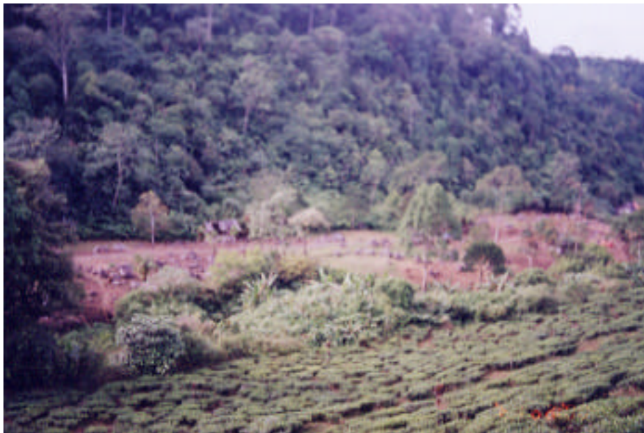
Figure F.3. Hill of Mount Gede (900m asl), Rasamala forest, rock, and tea plantation around Cipelang river that flows from Mount Gede to Selabintana, Sukabumi (figure F.1 ).